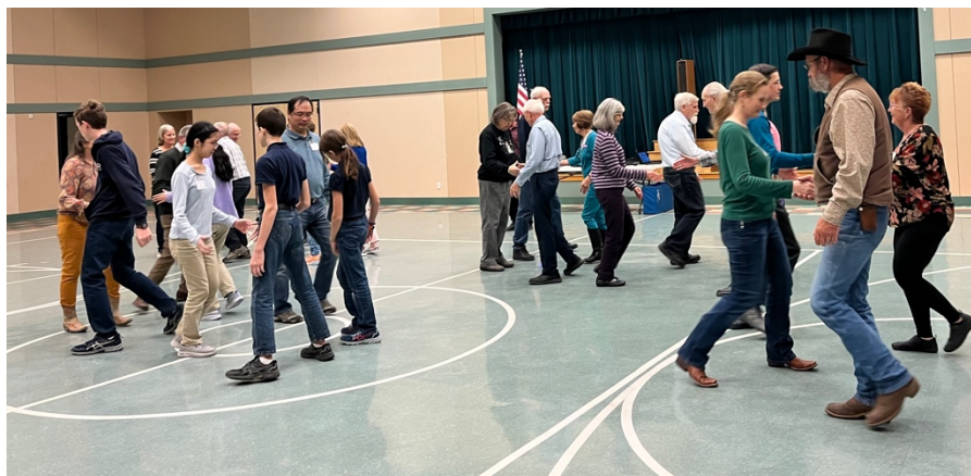
Moving Square Dancing into the 21 st Century

Every Wednesday evening, we are dancing at Christ Lutheran Church in Georgetown. 510 Luther Dr. Would love to have you join us.