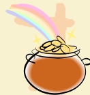
Split The Pot