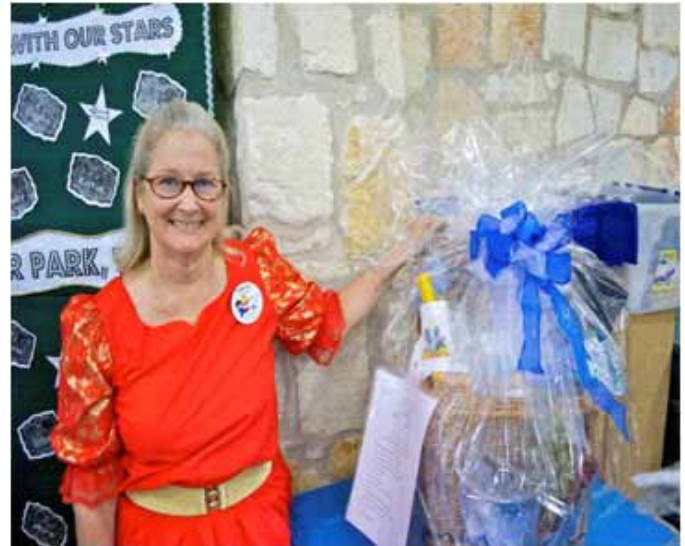
Happy Basket Winner