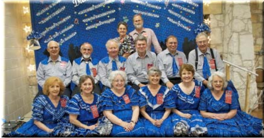
2010 Mid-Tex Committee