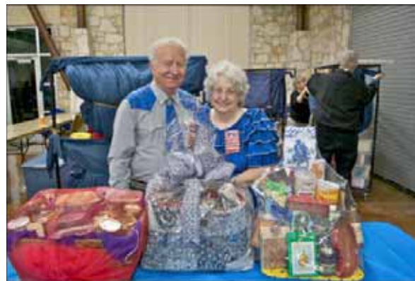
Dancing makes friends in 2009 & 2010