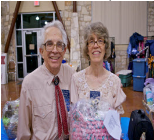
Happy Basket Winners