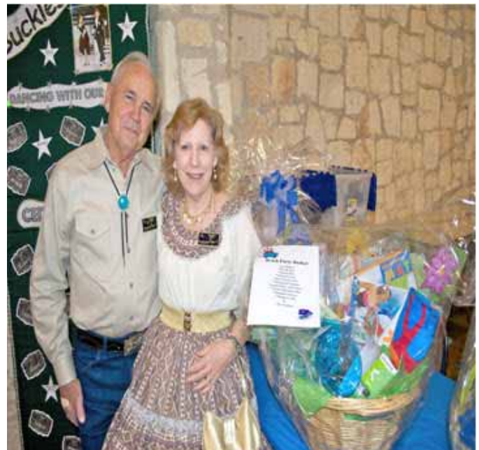
Happy Basket Winners