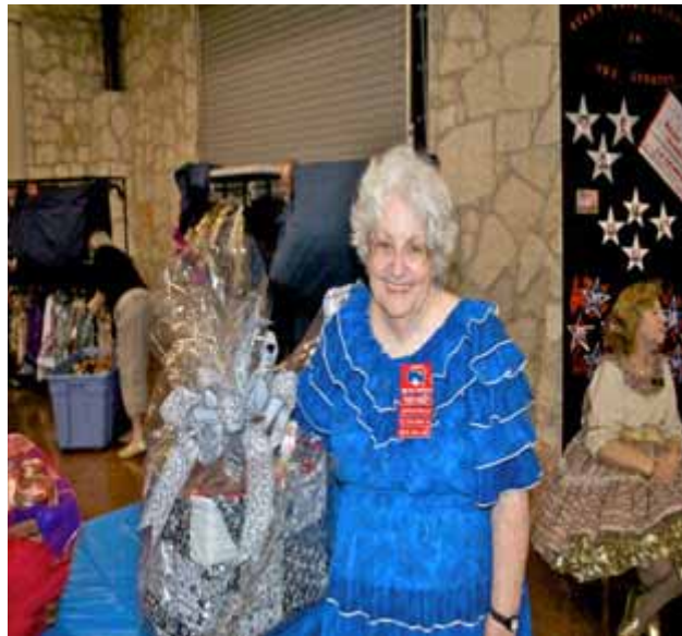
Happy Basket Winner

The Apaches will continue to dance on our regular Monday nights from 7:30 to 9:30 p.m. at Hyde Park Christian Church. Everyone is welcome to join us and we hope to see you there!